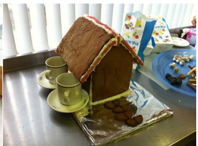
The structure is held in place with two coffee cups