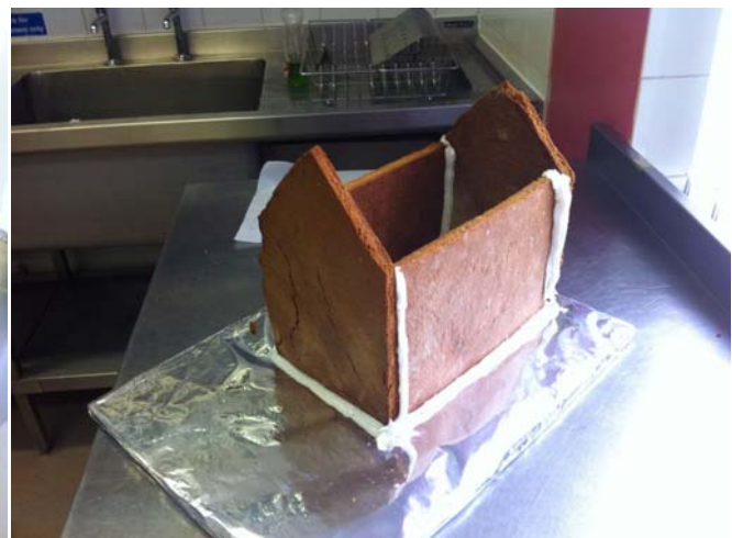
Tanya seals the house together – you can see it taking shape already