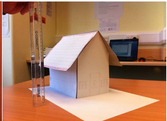
The team measure out the plans for the house