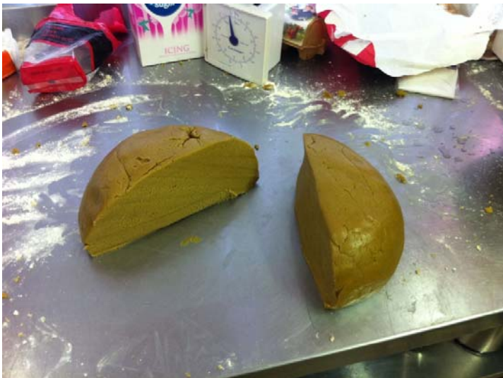
The gingerbread sets after a night in the fridge